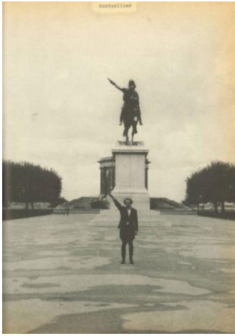
Anselm Kiefer, Occupations , 1969

Nazi ideology. The stigmata of this unfortunate association labelled Friedrich's work until 1974, when he was acknowledged by art historian Werner Hofmann as an artist of great value of the German Romanticism and universal art. In conclusion, in 1969 when Kiefer achieved Occupations , Friedrich's painting was still, more or less, part of the postwar cultural prohibition. We could go further on to refer to a certain identification between Friedrich's man with his back turned and that of Kiefer: both wear the Nazi "markings", understood as the consequence of the German thinking, extended to the whole sphere of culture just like the original sin.