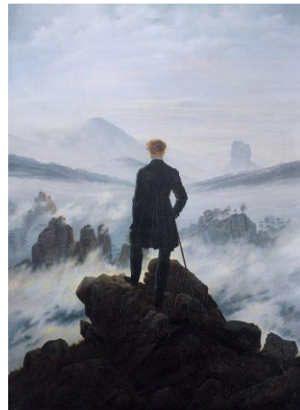
Caspar David Friedrich, Wanderer above the Sea of Fog , 1818